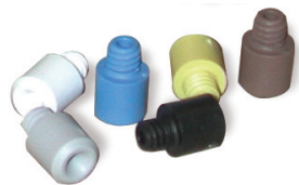
Metering Tips Part #NA0816A